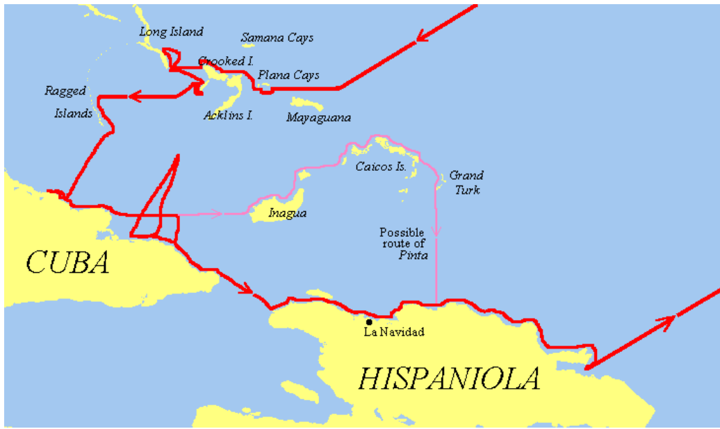
Columbus explored these places on his first voyage