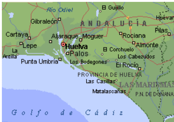
Columbus left from Palos